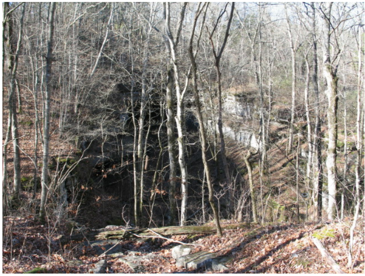
The Great Rock Sink

On our first day of survey ice formations were present outside as well as over 200 ft. into the cave. Some were 2.5 feet long. By the way the cave is a cold sink. The large passage and two-entrances created a wind chill that all noticed. Bill measured 34^\circ F. in the cave. The sketchers bare hands were cold but the resurvey was fun and worth it. Bill quickly produced a stick map using the cave survey software Compass in red and green of the results.