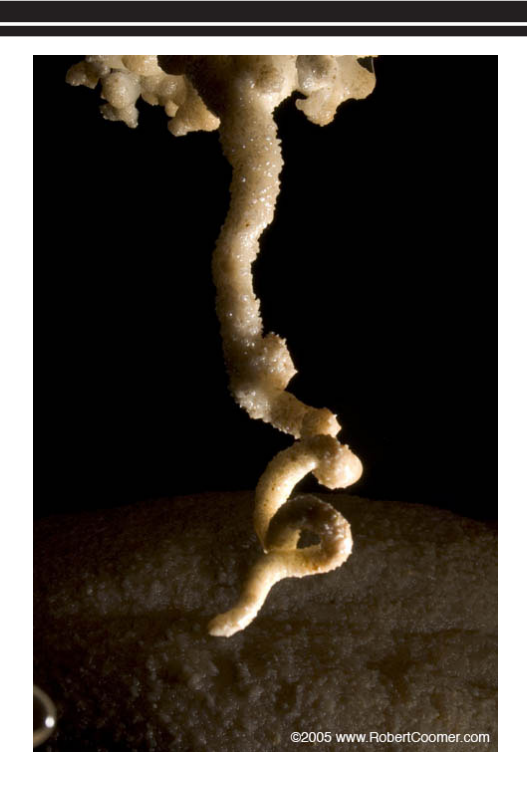
Stories of Mud and Pencils