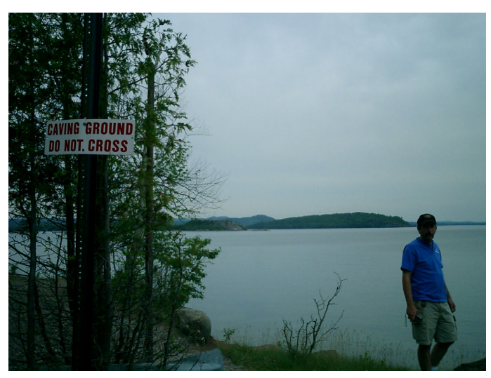
A sign designed to catch a caver's attention near Marquette, MI