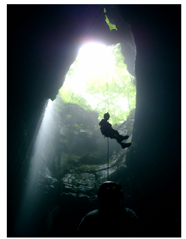
Stephens Gap, Alabama