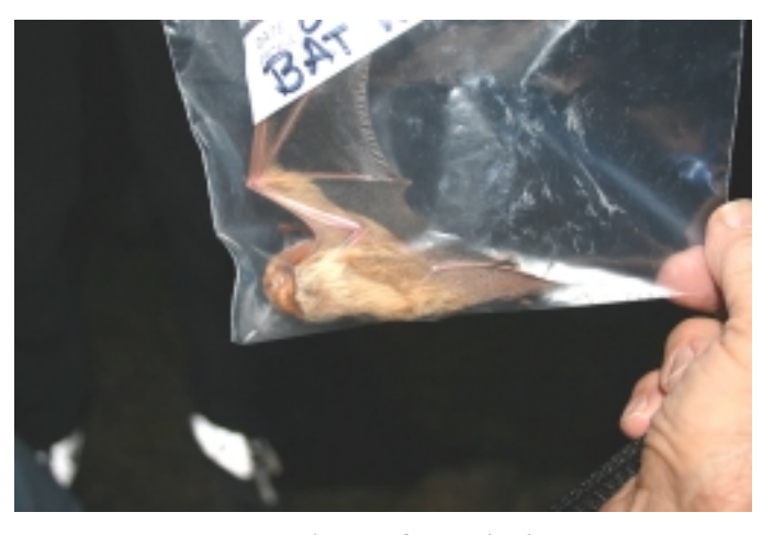
Red Bat in Bag for Weighing