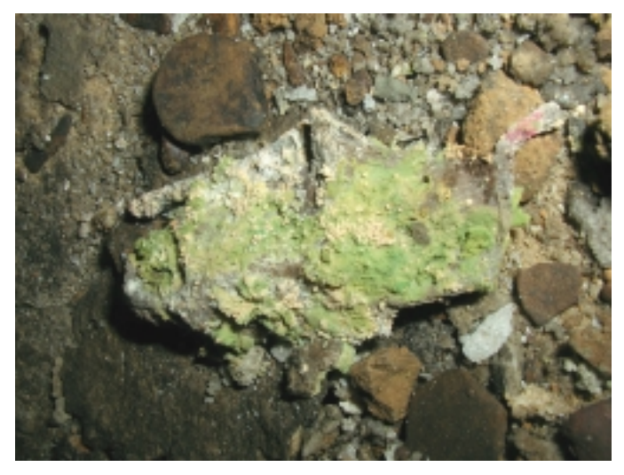
Green Bat in the Green Bat Passage of Jugornot Cave