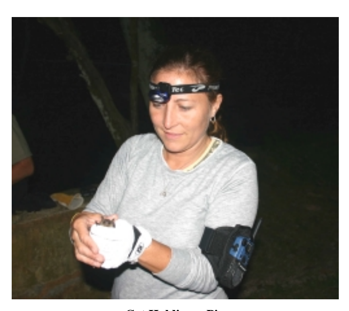
Cat Holding a Pip