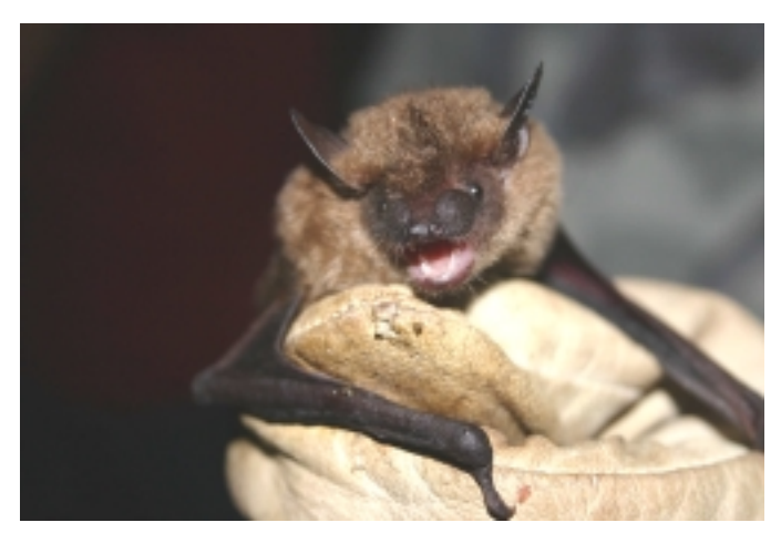
Small Footed Bat