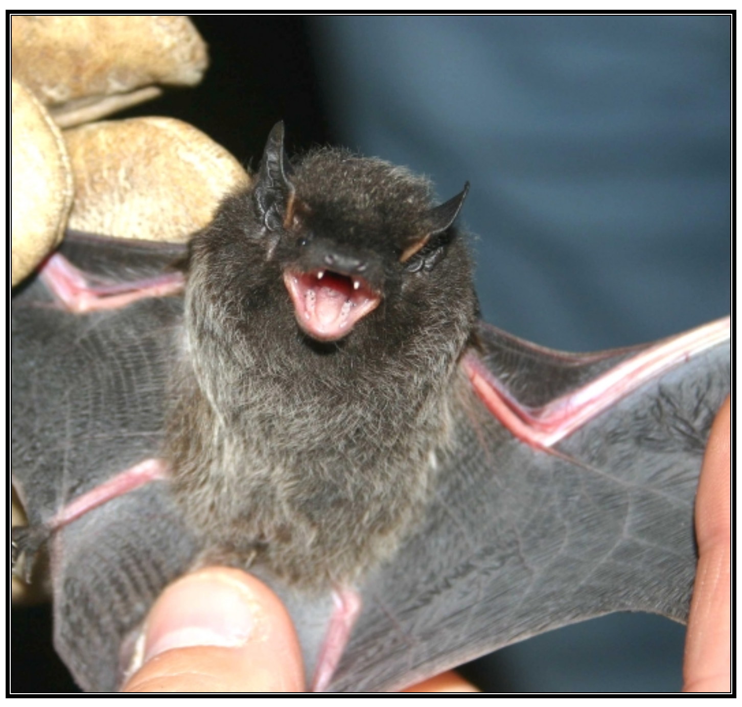
Silverhaired Bat