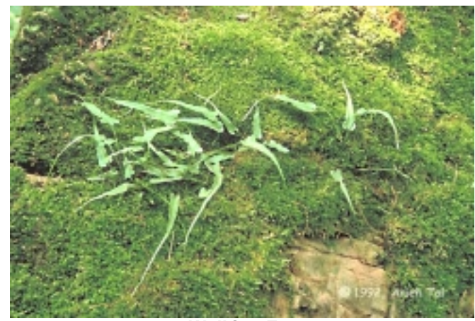
Walking Fern Asplenium rhizophyllum (Camptosorus rhizophyllus)

the pit without any luck. We did find a possible dig site - a hole blowing air with walking ferns around the small opening.