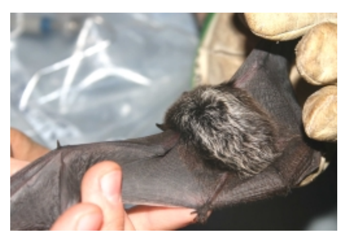
Backside of Silver haired Bat