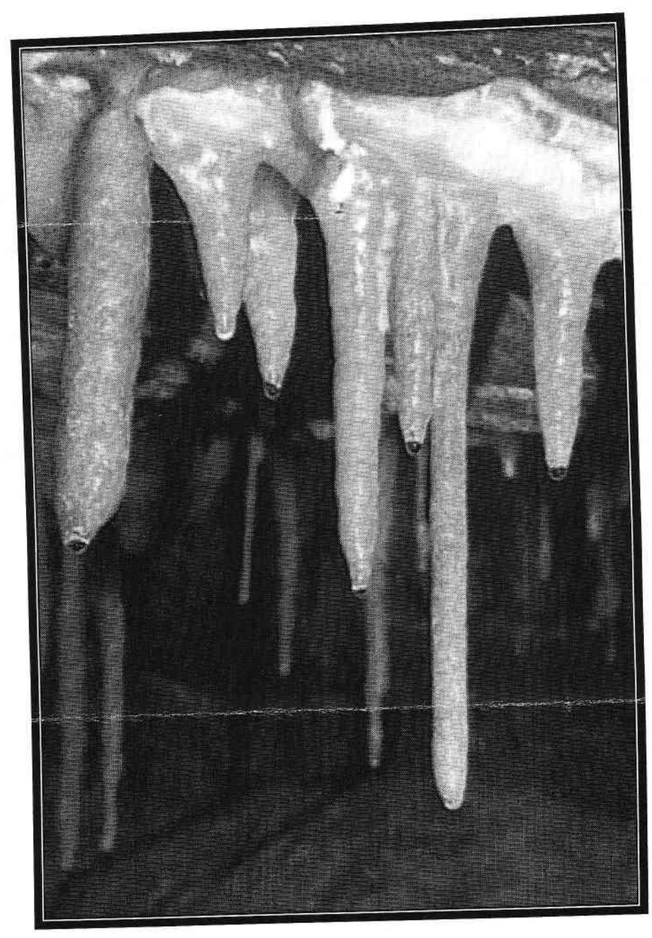
Wayne County, Kentucky Beauties.