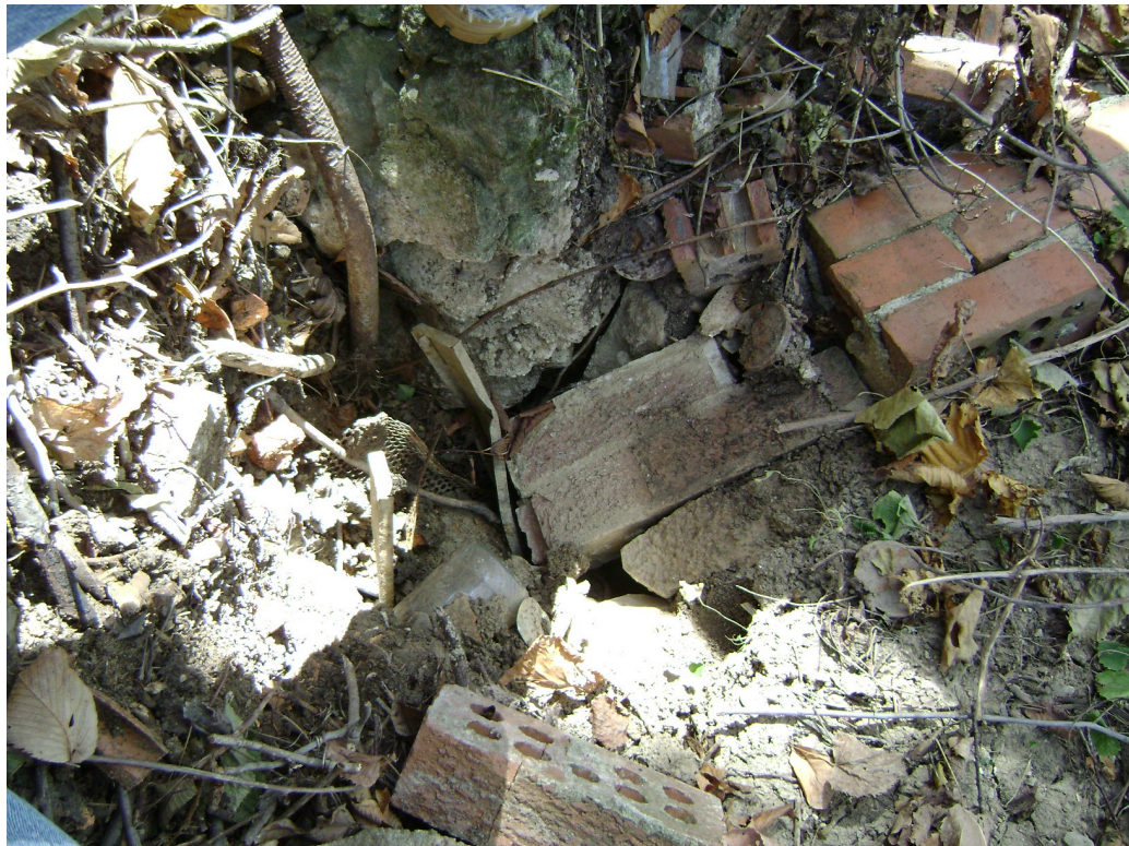
Junk in the Sinkhole