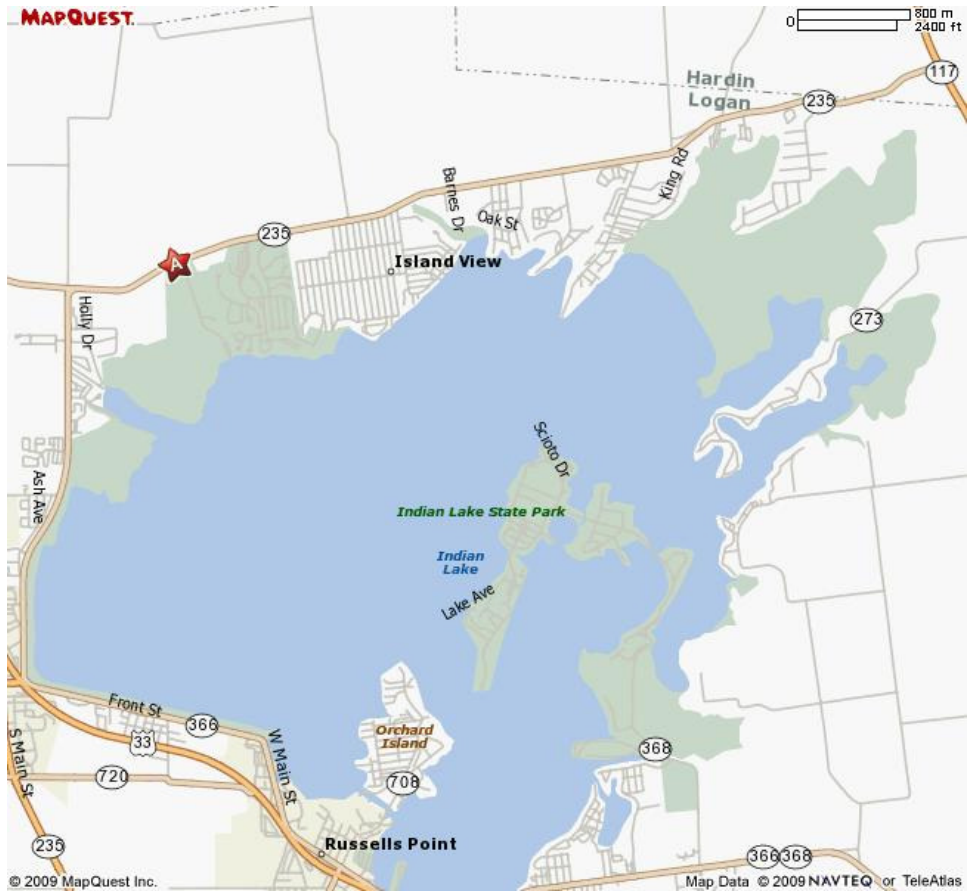
Indian Lake State Park